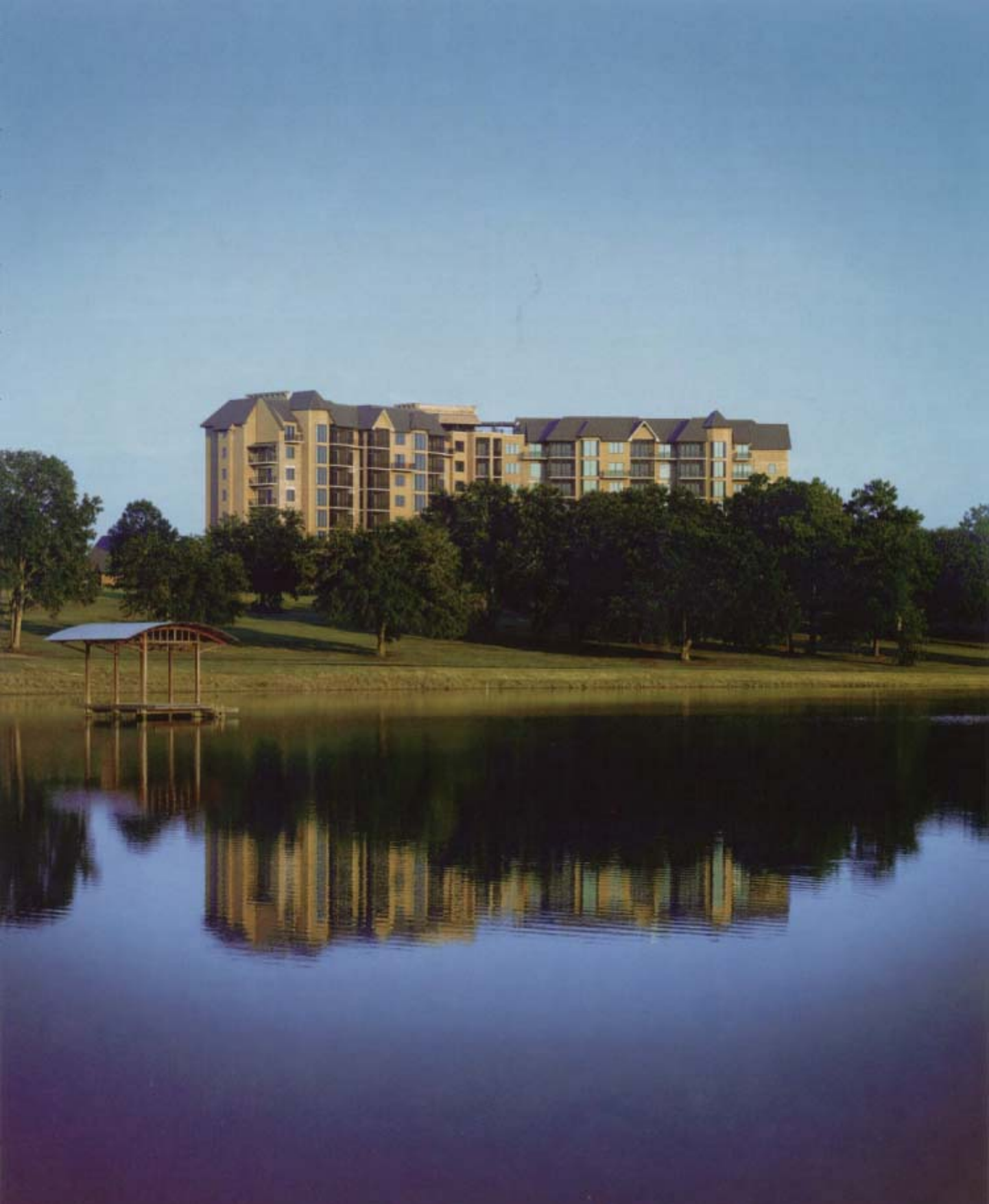
High atop a rolling hill sits Colony at the Grand's first beautiful new structure, aptly named Bayview.