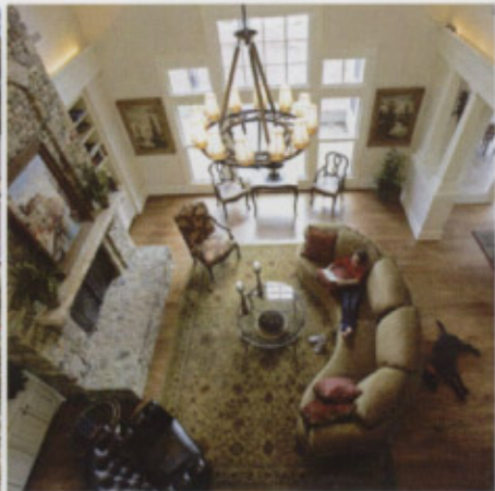
National Village, a new golfing community, features Craftsman style homes with luxury options and easy access to the top public golf site in the country.